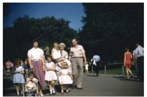
A walk in the park with my parents and children

we were the product of two very different life experiences, and she might never understand why I enjoyed and valued being a mother.