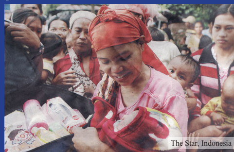
The Star, Indonesia

The use of feeding bottles and teats should be actively discouraged in emergency context due to the high risk of contamination and difficulty in cleaning. Instead, use of cups without spouts should be actively promoted.