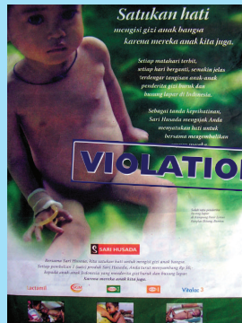
BTR 2007, Indonesia

Capitalising on the image of a malnourished child, Sari Husada made a philanthropic appeal to the public to buy its products for the sake of children in need. Although no reference was made to the devastating aftermath of the Indian Ocean tsunami, it is significant that this advert came out as rebuilding efforts were underway in Aceh, Indonesia.