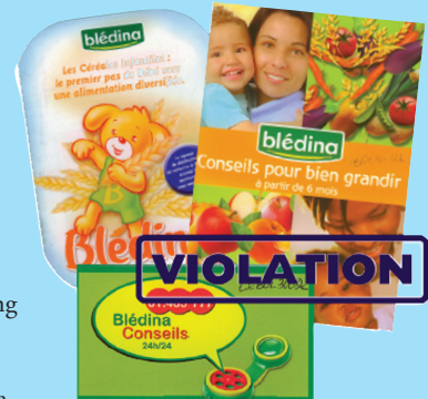
BTR 2007, Lebanon

Blédina produces infant formula, follow-up formula and many complementary foods. It was acquired by Danone in 1998. In 2007, Danone bought up all of Dutch NUMICO's companies. Since then, Danone and Nestlé run neck-to-neck to dominate the world market.