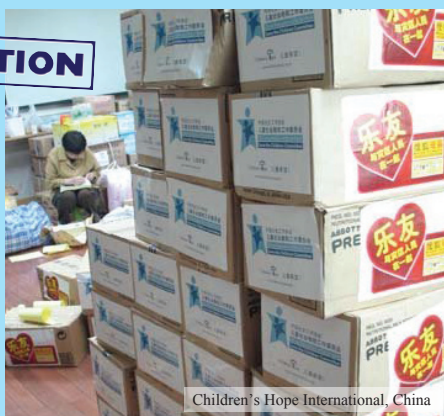
Piles of Abbott formula supplies after Sichuan earthquake.

“Donations of powdered milk in an emergency situation can literally increase the rate of death of young babies, while the people mean to do good.”