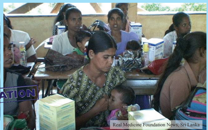
Real Medicine Foundation News, Sri Lanka

"Our maternity hospitals were flooded with breastmilk substitutes brought in by humanitarian aid agencies. This nearly destroyed our breastfeeding programmes."