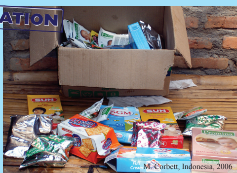
A box of donated ‘baby foods’ that a village woman had received in Java, Indonesia.