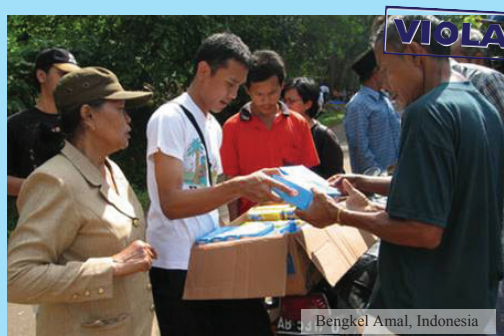
Milk and baby food for all. Companies often use emergency situations to offload products near expiry.