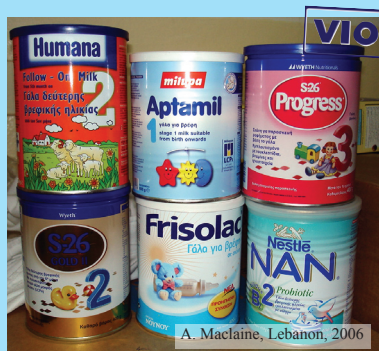
Labels of breastmilk substitutes shipped into Lebanon were in English and French, not Arabic.