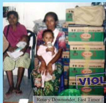
Rotary Downunder, East Timor