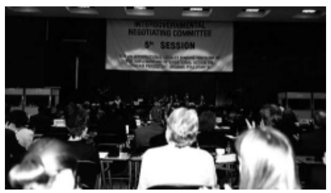
Intergovernmental Negotiating Committee 5th Session (INC5), Johannesburg, South Africa, 4-9 December 2000: On-going session.