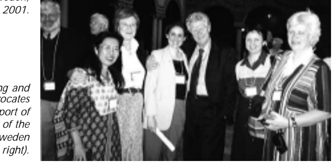
Breastfeeding and environment advocates had the support of Minister of the Environment, Sweden (3<sup>rd</sup> from right).