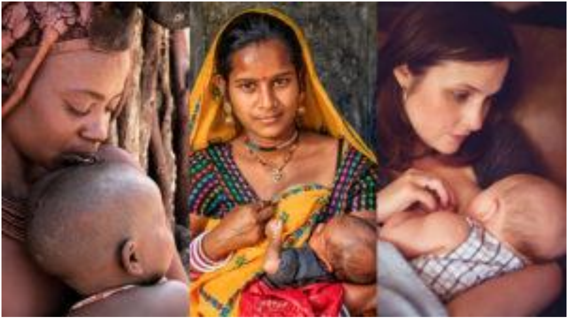
(From left) Mothers from Namibia's Himba tribe; from Amber, India; and from Washington state.

In many ways, parenting newborns seems instinctual.