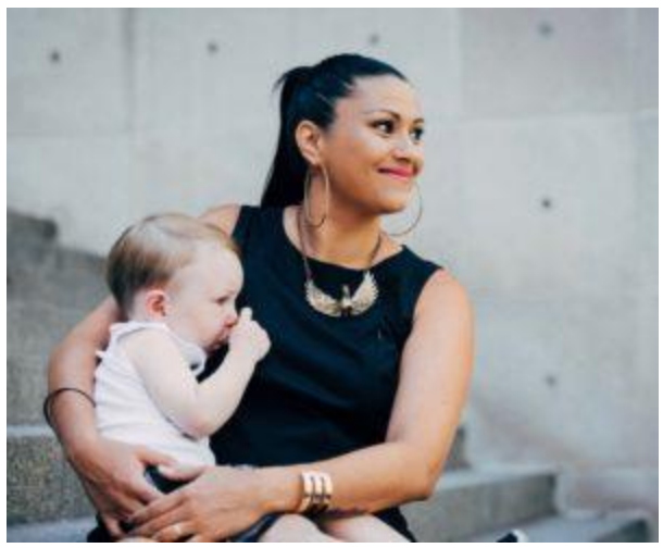
Leche Libre apparel, Chicago, IL. June 30, 2016.