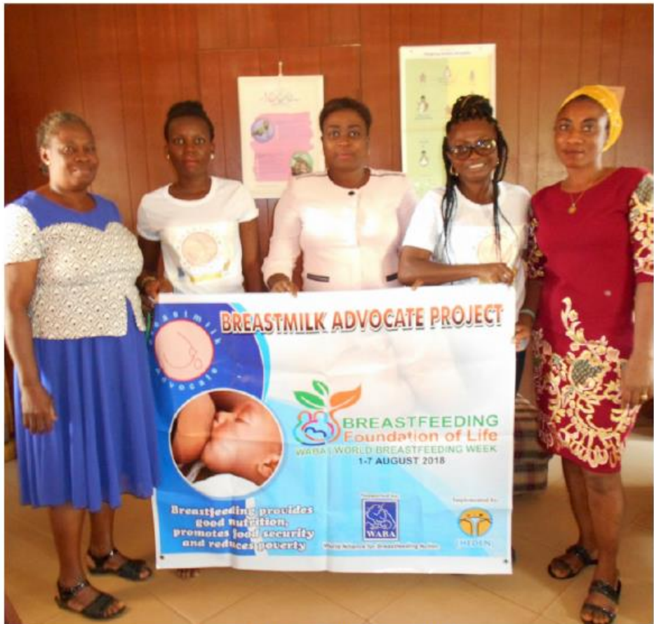
Advocacy Visit to the Medical Officer of Health

lasting impact. It uses advocacy to local policy makers, weekly talks with pregnant women and nursing mothers at community health centres, town hall meetings in communities involving men, a seminar for nurses and traditional birth attendants and demonstration of weaning foods to bring positive change in policy and behaviour and build social support. Best of all Breastmilk Advocate Project is designed to achieve Sustainable Development Goals 1, 3, 4, 10 and 11 (No poverty, Good health and well-being, Quality education, reduced inequalities, and sustainable cities and communities). Breastmilk Advocate Project extended beyond the planned period of 10 days from July 30 to August 8, 2018, to August 23 2018. The success of the Breastmilk Advocate project includes; the support for the project advocacy points by two policymakers- the Medical officer of Health and the Chairman of Ifo Local government.