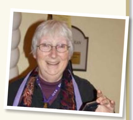
July 2009 at the ILCA Conference

one of her major contributions included working with the Women Count Network to value women's reproductive work, particularly care work and breastfeeding, and linking them with WABA.