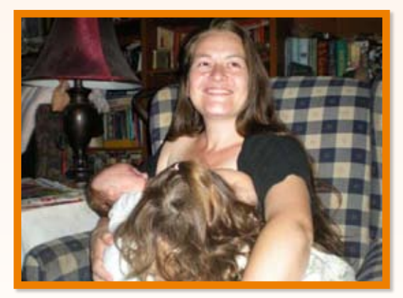
Tandem nursing the two youngest.

I also believe that it is this network and the support and knowledge I received that helped me successfully transition my preemie from bottles of expressed milk to exclusively breastfeeding. This process took 9 weeks after he was discharged from his 3 week stay in the Neonatal Intensive Care Unit.