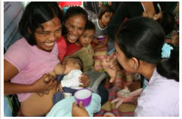
Sirum, Basey, Samar.

Many of the surviving families who, earlier on, were crammed into evacuation centers resettled in their respective communities. Thus, the Arugaan BESTeam decided to continue their support by journeying to nearby municipalities that suffered the most severe damage from the typhoon. Five teams journeyed in rented jeeps to provide breastfeeding counseling intervention for those most likely to still need immediate attention. They sought out mothers with babies, as well as pregnant women in every home in each community they came to along the coastal shores. This took place especially in areas where devastation was clearly visible. They continued with their work despite exhaustion and the psychological stress of what they saw.