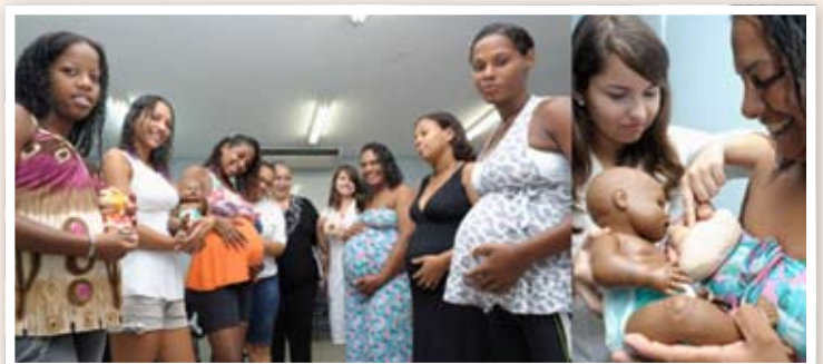
Weekly Meeting Breastfeeding Group for pregnant women: In the USF in Vitória where the main objective is to work at Relaxation of mother and baby during pregnancy.

More than 80% of the pregnant women who took the course breastfed their children exclusively for six months!