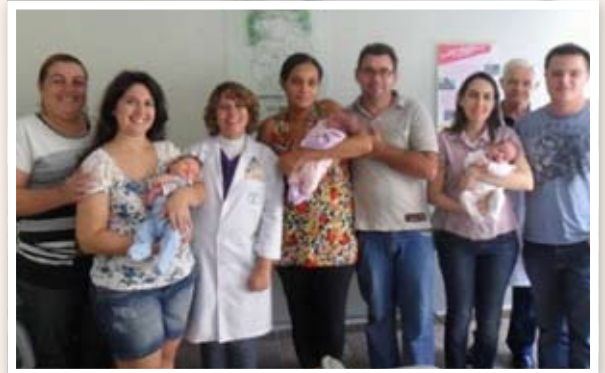
Mothers with their babies, husbands, partners in a support group at the Model Hospital – Intermédica Sistema de Saúde de Sorocaba.

The Model Hospital – Intermedical Health System of Sorocaba, which was certified as a Baby Friendly Hospital in 2010, has an open door clinic where scheduling appointments only exists with the doctor once a week. Without scheduling, the hospital receives the whole family and normally the woman usually brings along a family member who has difficulty in understanding why breastfeeding is important. The idea is to disseminate breastfeeding through the families!