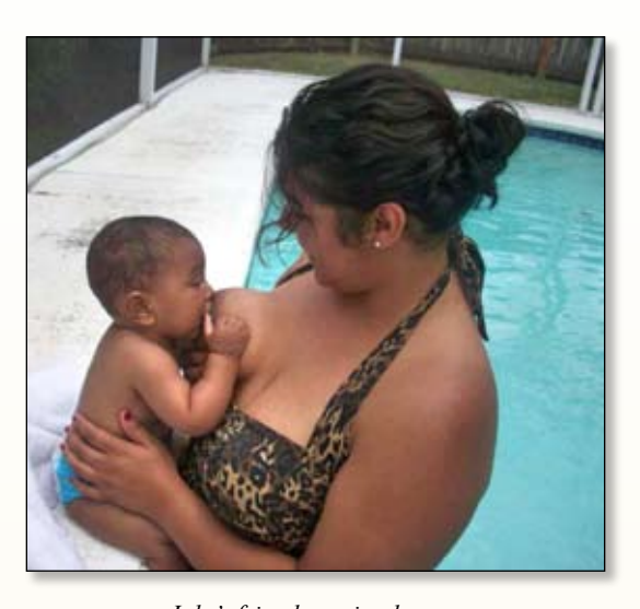
Iola's friend nursing her son at a poolside.

I could not put my finger on it but I knew something was missing. Breastfeeding my son was going great, we were 8 months strong. Then one day it hit me; it was the straw that broke the camel's back. A picture was posted on Facebook of a woman located in a village, in a country on the continent of Africa. It was of a mother breastfeeding her son, standing in front of a hut. This picture was a beautiful picture and I had no problem with it until I read the comments. A woman commented saying "it's nice to see a woman of color breastfeeding." I may have gone on a rant about how I am a breastfeeding woman of color and how for once I did not want to see a woman who stepped off the cover of a National Geographic Cover.