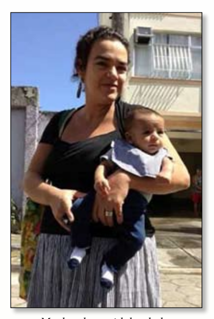
My daughter with her baby.

There was a panic attack in the last 20 days before the move, but everyone helped and things were arranged little by little and yet today there are boxes that haven't been opened.