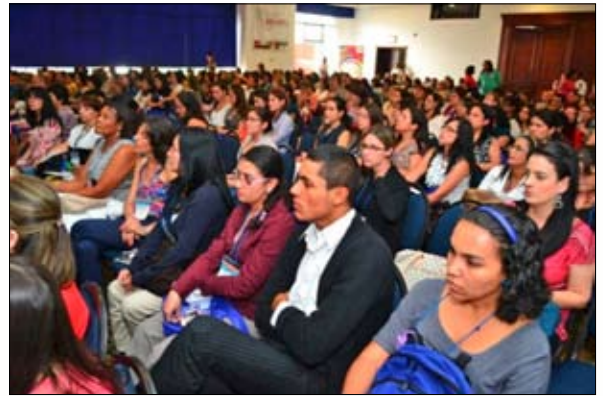
Participants at the conference.

Coming from 40 Colombian cities and 21 countries, including Spain, Canada, USA, France, Israel and a great part of Latin America, participants fulfilled their expectations in terms of the quality of the conference, as well as the topics that were addressed and the organization of the event. Without a doubt this was a great opportunity to position LLLI as a world authority in breastfeeding and childcare and to create awareness about such an important topic as breastfeeding for the future of humanity.