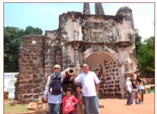
On holiday with the family.

My experience during this 6 month period with my son taught me that biological bonding is greater through breastfeeding (at the breast) and premature separation of an infant from the mother affects both the frequency of breastfeeding and bonding. This is the difference I felt when comparing my previous breastfeeding experiences. From the evidence based lactation facts, breastfeeding provides better immunity and resistance to respiratory and gastrointestinal infections, even viral fever. However, it is achieved through exclusive breastfeeding, not through bottlefeeding expressed breastmilk (EBM). The practice of EBM storage in a freezer destroys the live cells in breastmilk and reduces the effectiveness of the immunoglobulins in breastmilk.