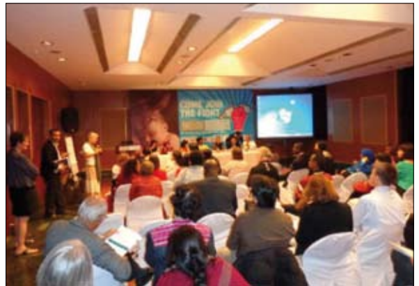
Conference Session by the Brazilians.

We maximised our participation at the World Breastfeeding Conference 2012 as best as we could, since we could not be present at all the plenary sessions, nor at all meetings. The Conference focused on policies for the promotion and protection of breastfeeding. Support groups were in the minority, although there were representatives of Ammhjelpen, La Leche League, and Indian Groups, in addition to Amigas do Peito.