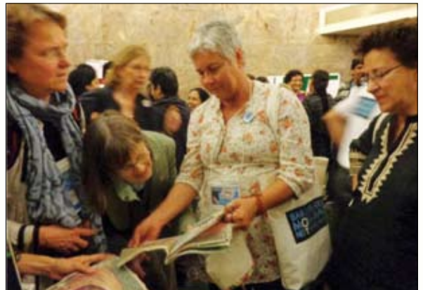
Showing the cloth book to mother support groups.

At the IBFAN LAC booth Amigas do Peito displayed printed materials from MINA (the Brazilian network of support groups for breastfeeding mothers), RUMBA LAC, Breastfeeding News in Portuguese by IBFAN Brasil and the IDEC Brasil magazine that published the 2012 monitoring results in Brasil. These materials were distributed in addition to Amigas do Peito Educational Play materials, which were for sale.