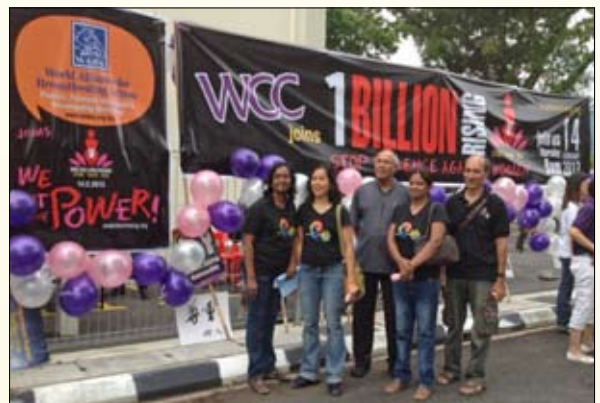
The WABA Team at the Global Campaign.

WABA celebrated its 22 nd Anniversary on February 14, 2013 by joining the global campaign, ONE BILLION RISING to Stop Violence against Women and Girls around the world. WABA asserts that gender based violence has serious consequences on women's reproductive health and life – including her right to breastfeed her children – and it must be stopped! Women must have the ability and right to live safe, healthy, meaningful and productive lives at home, at work and in their communities.