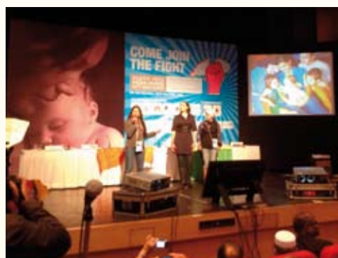
Presentation by the Youth.