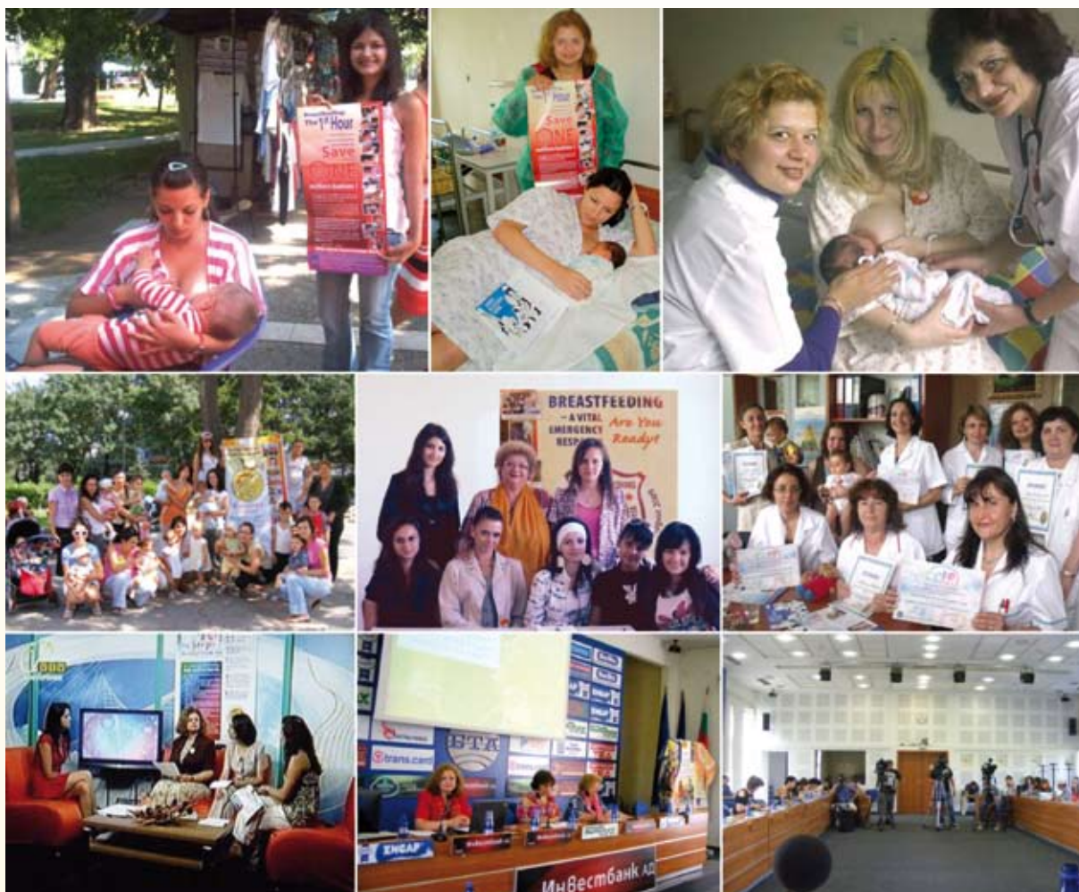
Supporting and Promoting Breastfeeding in Bulgaria.

Our mission is to protect the rights of children and mothers and promote and support breastfeeding. We work to implement this through legislation of the International Code of Marketing of Breastmilk Substitutes and subsequent UNICEF and WHO Resolutions.