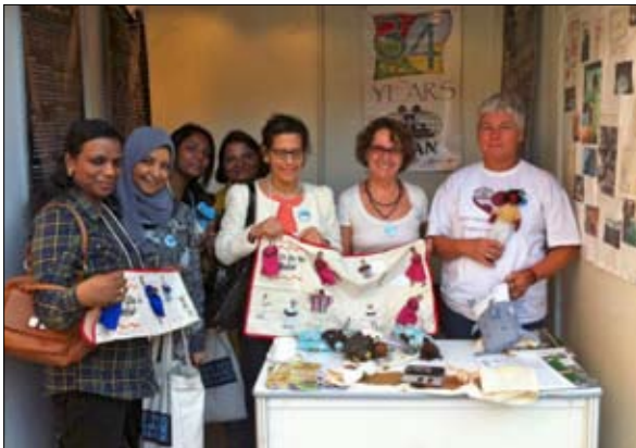
Amigas do Peito displaying and selling their materials at the IBFAN LAC booth.