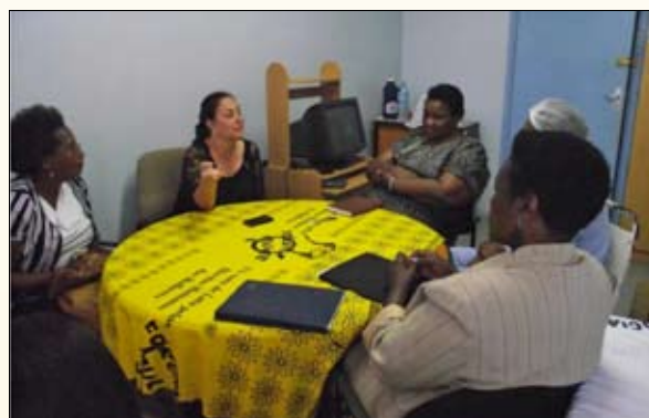
Abilene with midwives and physician during their exchange of information.