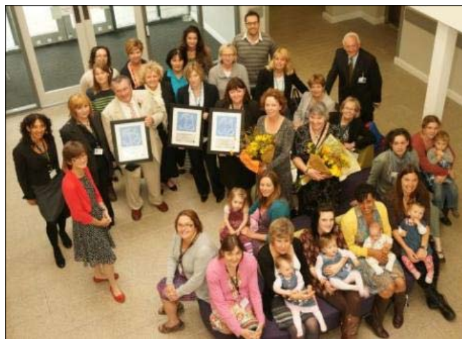
A group shot of everyone at the event, including the three award winning organisations.

High quality care of mother and babies in Cornwall has led to three organisations being awarded the prestigious Baby Friendly Accreditation by UNICEF.