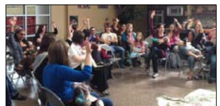
More than 20 children were breastfed as part of national challenge and awareness campaign at the Kitchener Market on Saturday, Sept. 29, 2012.