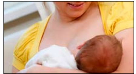
The 12 th annual Global Breastfeeding Challenge also had events in countries such as China and Romania.