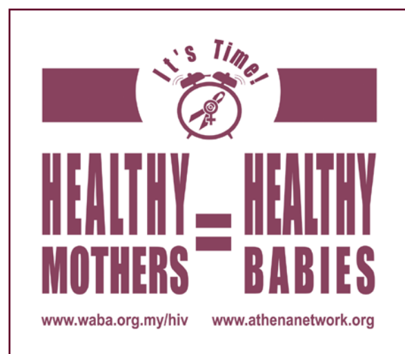
WABA campaign material for the XVI IAC, August 2006