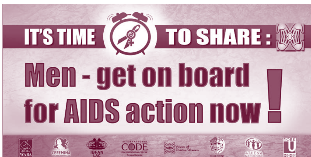
WABA banner for the XVI IAC, August 2006