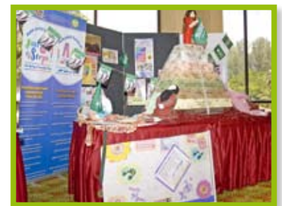
The booth from Riyadh at the GBPF forum in Penang

Representatives from many different countries attended the event, which displayed worldwide enthusiasm. The information provided by the workshop was relevant and the speakers were informative and knowledgeable. The forum gave us an opportunity to meet breastfeeding partners and some of the key role players involved in breastfeeding. Attending such event gave us a chance to reflect Saudi Arabia efforts in breastfeeding promotion. The knowledge that we have gained from this experience will definitely contribute to the empowerment and expansion to promote, support and protect breastfeeding promotion as well as empower training in lactation management in Saudi Arabia.