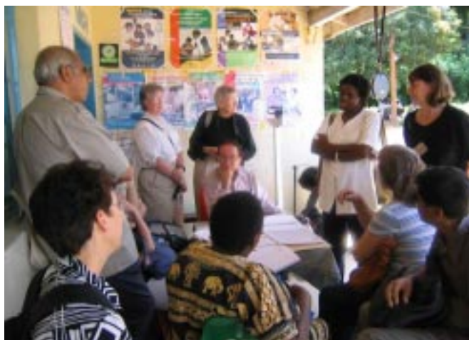
Participants learnt more on the realities of PMTCT programmes during field visits in Zambia.