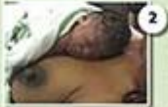
2 Reorientation The baby is reorienting to the world's location.