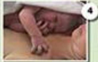
4 Activity The baby is moving his arms, legs, and mouth.