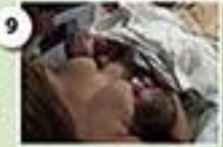
9 Sleep The baby is sleeping peacefully after the first hour.