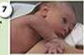
7 Familiarization The baby gets acquainted with the person holding it.