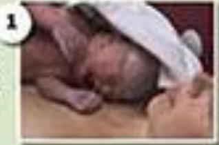
1 The Birth Cry The newborn is crying because of the bright lights and the sound of the baby's heartbeat.