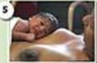
5 Root The baby turns its head toward the person holding it.