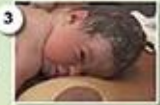
3 Awakening The baby opens his eyes and starts to move for the first time.