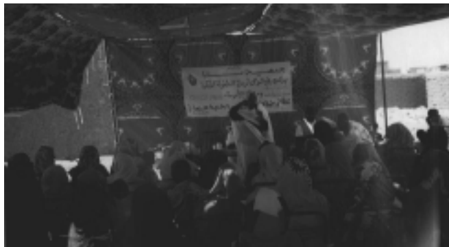
Attentive...SABA giving a public lecture on breastfeeding