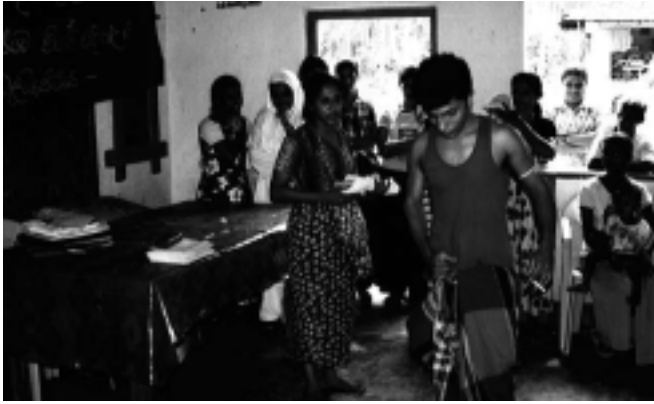
University of Sri Lanka undergraduates depicting realities faced by breastfeeding mothers in a drama for villagers

Sri Lanka: An awareness programme, organised by the Nutrition Society of the Wayamba University of Sri Lanka, was held in a rural village at Kuliypitiya to celebrate WBW 2002. Undergraduates of the university went to mother-child health clinics in villages to stage a drama performance. Later, they discussed breastfeeding practices among the village mothers.