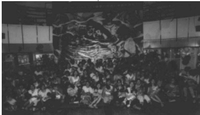
Gathering in a hall for women's activities in Taiwan

Taiwan: On 4 August, more than 50 pairs of mothers and babies breastfed at the same time in Taichung County. At the gathering, family games and lectures on infant and young child nutrition were also held. Mothers from support groups demonstrated breastmilk expression for working mothers. Exhibits from various hospitals were also set up. Materials such as the Chinese action folder and breastfeeding madnets were distributed to the participants. The action folder was also disseminated to various Chinese-speaking countries in Asia.