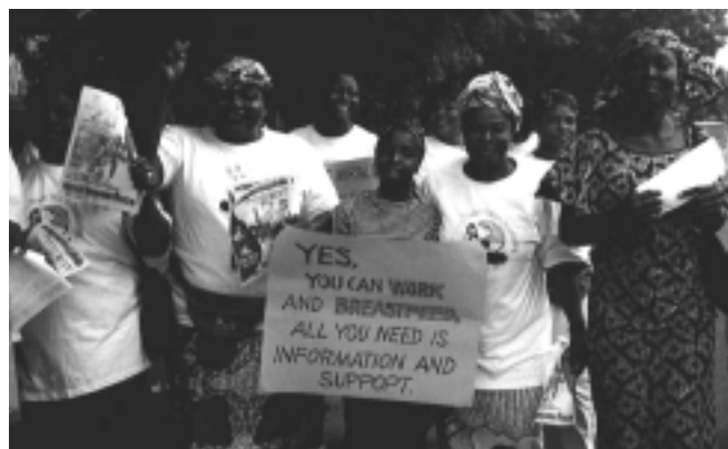
Breastfeeding Awareness Network brings breastfeeding messages to the streets in Nigeria during WBW

A public service announcement that directs mothers to ILCA for breastfeeding help was aired in the US during WBW, featuring happy babies and refers to the healthful benefits of breastfeeding for infants and mothers. The tapes were distributed to television stations in key cities in the US. The voice over tag line is "For help with breastfeeding, ask your healthcare professional, visit ilca.org or call the International Lactation Consultant Association". ■