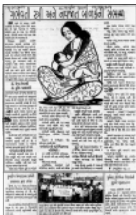
Extra, Extra!... Breastfeeding made headlines in newspapers in India

More groups celebrated WBW in India in 2001. The Indian Medical Association (Singrauli) and Singrauli Obstetric & Gynaecological Society joined effort in their outreach programmes during the week, reaching many in the States of Madhya Pradesh and Uttar Pradesh. Training on breastfeeding was conducted for health workers in the coal mines of Northern Coalfields Limited (NCL) and surrounding area. For students, an essay competition on the Role of Breastfeeding in the Development of Children was organised. A series of talks, audio-visual displays and distribution of educative pamphlets were also done in villages and schools.