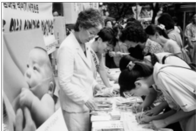
"Yes, I pledge to breastfeed!"... thousands of signatures were collected.

WBW in Korea became a national event. Besides designating three new Baby Friendly Hospitals, the Korean Committee for UNICEF organised a breastfeeding agreement campaign at Myungdong, a busy shopping district in Seoul. 5,500 people signed up agreeing to breastfeed. Agreements were also sent through the Internet and post. The 7-day campaign saw the participation of 7,500 people. In another event, top-ranked actress Shi-Ra Chae was designated the Ambassador for Breastfeeding for her active role in promoting breastfeeding. Chae herself is breastfeeding and refuses to appear in breastmilk substitutes advertisements. The Committee also collaborated with national daily Hankyoreh to carry weekly special reports on breastfeeding from August through December.