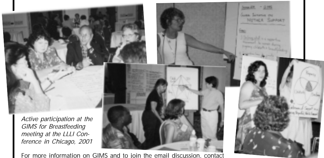
Active participation at the GIMS for Breastfeeding meeting at the LLLI Conference in Chicago, 2001

Through GIMS, the Mother Support Task Force hopes to work more closely with breastfeeding groups and forge links with other issue movements such as those working on humane childbirth practices, family support, midwifery, and women's health and rights to facilitate a holistic view on mother support.