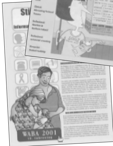
Top to bottom: Publications on breastfeeding from France, UK and Germany

More groups celebrated WBW in India in 2001. The Indian Medical Association (Singrauli) and Singrauli Obstetric & Gynaecological Society joined effort in their outreach programmes during the week, reaching many in the States of Madhya Pradesh and Uttar Pradesh. Training on breastfeeding was conducted for health workers in the coal mines of Northern Coalfields Limited (NCL) and surrounding area. For students, an essay competition on the Role of Breastfeeding in the Development of Children was organised. A series of talks, audio-visual displays and distribution of educative pamphlets were also done in villages and schools.