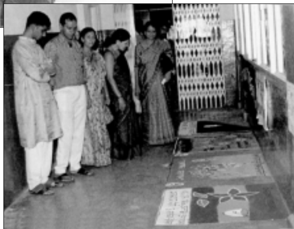
Right: Judges had a tough time selecting the best breastfeeding rangoli, a design art using coloured rice

In Bangladesh , as many as 26 organisations joined the Bangladesh Breastfeeding Foundation (BBF) in their innovative programmes, carried out from national to community levels. About 800 people led by the Health Secretary rallied from the Children's Park to the National Press Club. Songs and materials developed by BBF were brought to slum areas and gifts were given to a mother in each slum who breastfed exclusively for six months. Health education and discussions in schools, mosques, and among doctors, newly weds and nursing mothers were also organised in addition to art and essay competitions. Finally, BFHI awards were distributed to deserving hospitals.