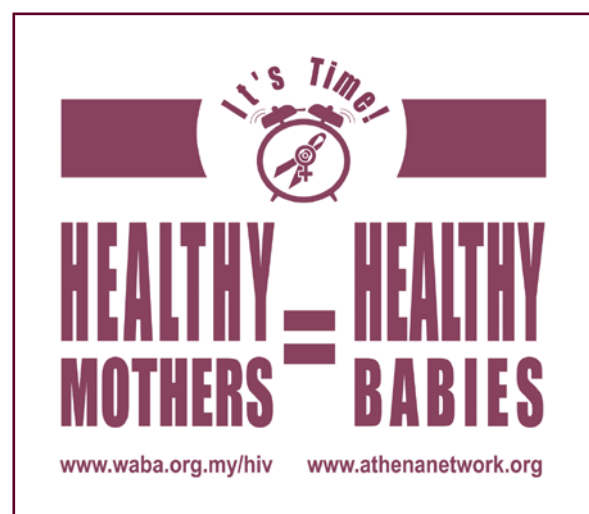
WABA campaign material for the XVI IAC, August 2006