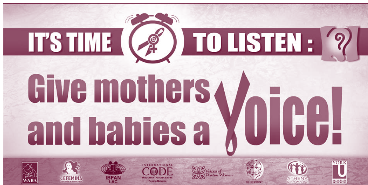
WABA banner for the XVI IAC, August 2006