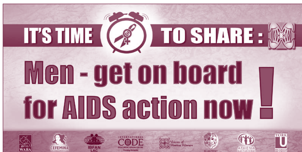
WABA banner for the XVI IAC, August 2006