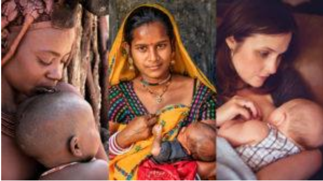
(From left) Mothers from Namibia's Himba tribe; from Amber, India; and from Washington state.

In many ways, parenting newborns seems instinctual.