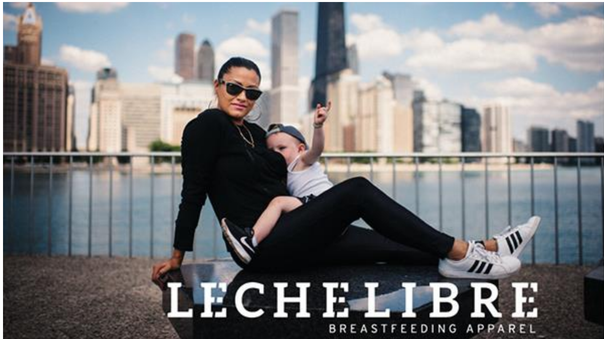
Leche Libre apparel, Chicago, IL. June 30, 2016.