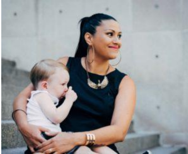
Leche Libre apparel, Chicago, IL. June 30, 2016.